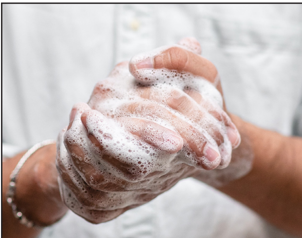
rub hands together