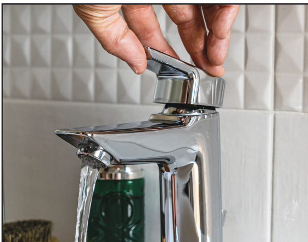
turn on water