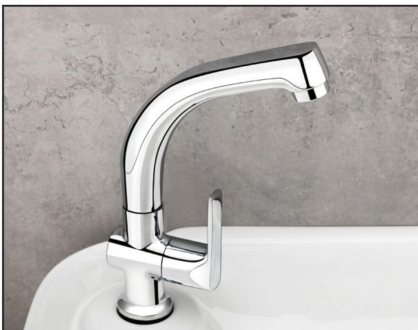
turn off water