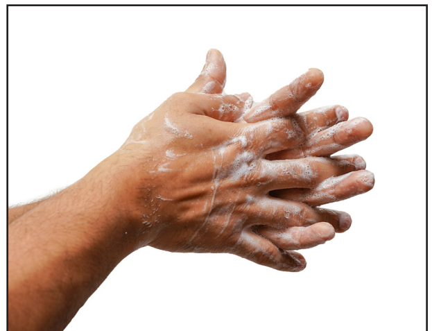
rub fingers together